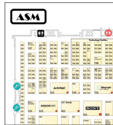
Online Floor Plan (Exclusive): $3,400