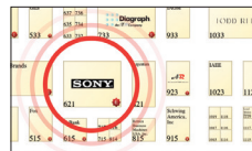
Floor Plan Booth Logo: $550